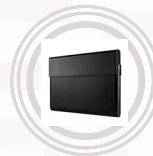
ThinkPad X1 Ultra Sleeve