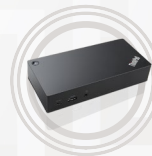
ThinkPad Thunderbolt 3 Dock