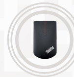
ThinkPad X1 Wireless Touch Mouse